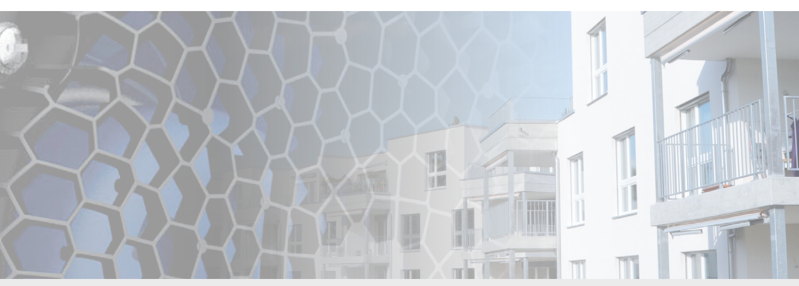
The Royal League in ventilation, control and drive technology